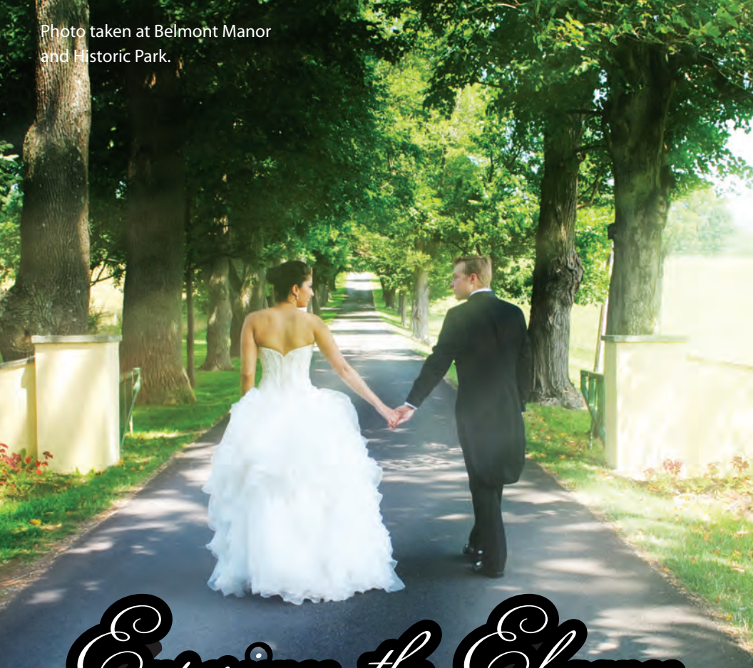
Photo taken at Belmont Manor and Historic Park.